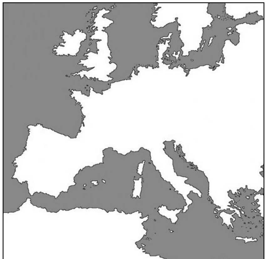
End of his reign